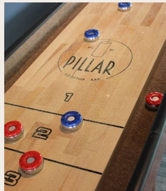
A shuffleboard game with custom logo looks great in the new space.

This included new furniture and artwork, greenery, shuffleboard, and more! Many of the interior walls were painted in darker shades of blues and greys to enhance the mood. Rugs and other décor were added and lighting was dimmed to help create an authentic vibe. Upon reopening, much of the great staff at the Pillar returned to bring back the outstanding service that everyone has grown accustomed to. Without them, the space is nothing more than an empty bar! With safe practices in place, we hope that the bar will continue to provide our guests with a memorable experience, including fresh sounds from local musicians, a great view, and maybe even a craft cocktail to go along with it all.